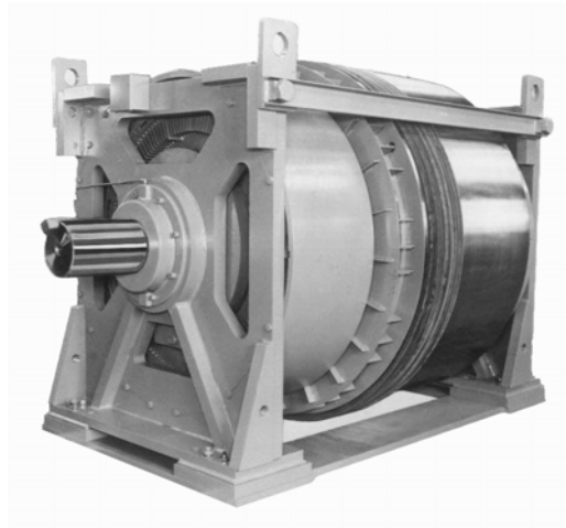
16,600 to 89,000 lb. ft. Torque Capacity High Capacity CES Press Drive

The CES (Constant Energy System) Package Press Drive is a combination of an air-cooled adjustable speed drive, brake and belt ring flywheel in a common housing. The package is mounted in pedestals and tie bars on a base plate. Tubing is provided for supplying oil to the bearings. The press drive can function within a wide stroking range while exercising full control of the slide within individual strokes; and it can produce